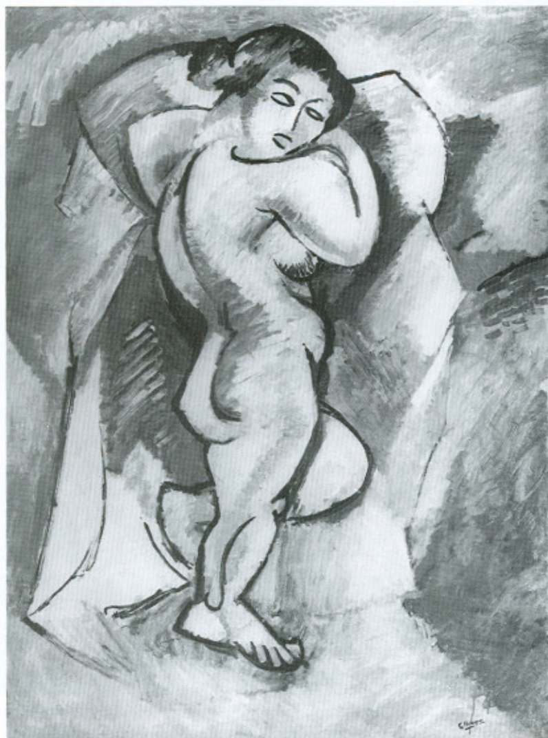
Plate 103 Georges Braque, Grand Nu (Large Nude) , December 1907–June 1908, oil on canvas, 140 x 100 cm. Collection Alex Maguy, Paris. © ADAGP, Paris and DACS, London 1993.

Just as there are innumerable words in a language, so too there is a huge range of linguistic conventions. But what ensures that they relate to one another and don't 'get in each others' way'? And how are we to grasp them all? Saussure claims that language has a