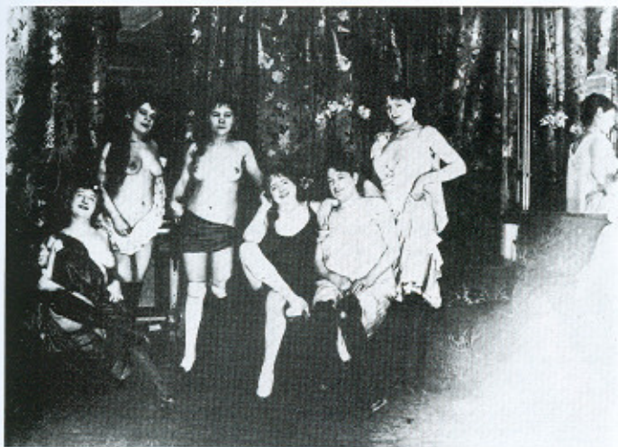
Plate 95 François Gauzi, Les Salons de la rue des Moulins , c.1900