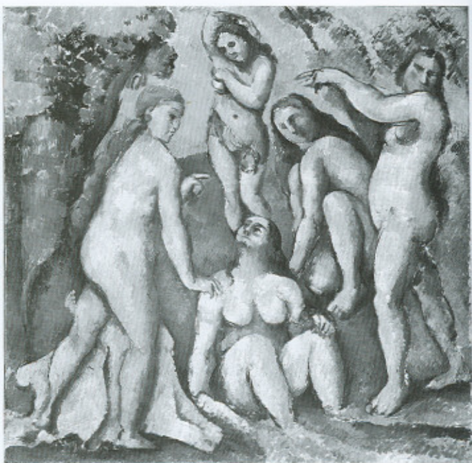
Plate 101 Paul Cézanne, Cinq Baigneuses (Five Bathers), 1885–87, oil on canvas, 65 x 65 cm. Oeffentliche Kunstsammlung, Basel.