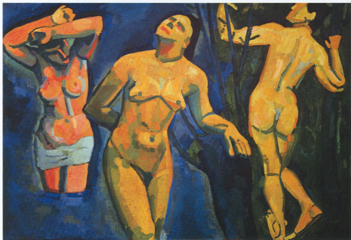
Plate 102 André Derain, Baigneuses (Bathers), 1907, oil on canvas, 132 x 195 cm. The Museum of Modern Art, New York. William S. Paley and Abby Aldrich Rockefeller Funds. © ADAGP, Paris and DACS, London 1993.