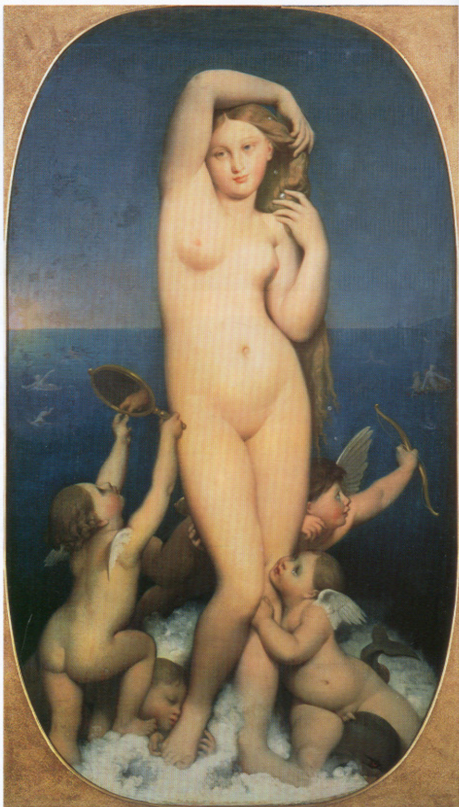
Plate 97 Jean-Auguste-Dominique Ingres, Vénus Anadyomène , oil on canvas, Musée Condé, Chantilly.