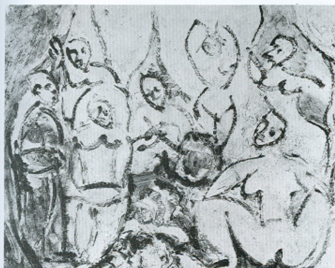
Plate 94 Pablo Picasso, study for Les Femmes d'Alger , spring 1907, oil on wood, 19 x 24 cm. Heirs of the artist. © DACS 1993.