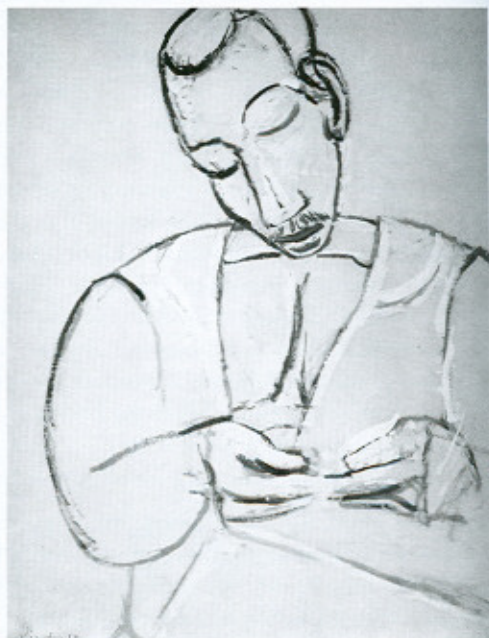
Plate 92 Pablo Picasso, study for Les Demoiselles d'Avignon (also known as Sailor Rolling a Cigarette ), winter-spring 1907, gouache on paper, 62 x 47 cm. Berggruen Collection on loan to National Gallery, London. © DACS 1993.