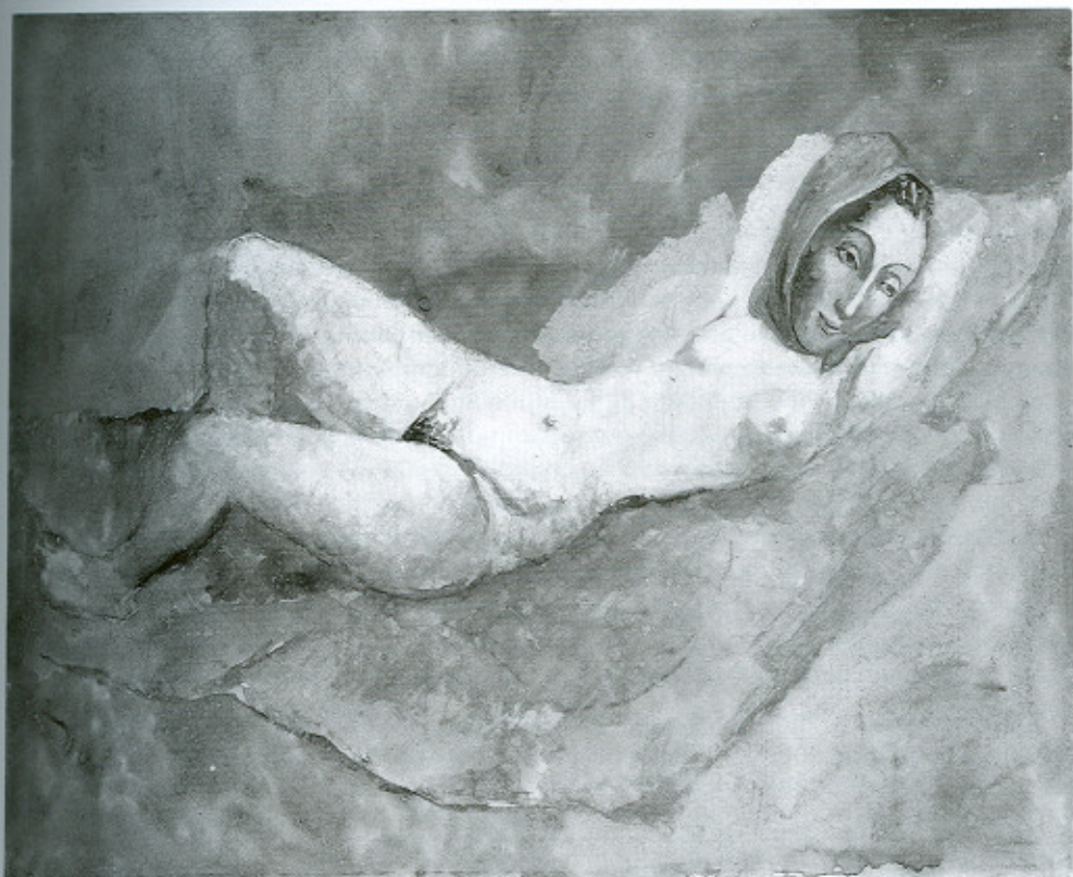
Plate 104 Pablo Picasso, Reclining Nude (Fernande) , spring-summer, 1905, gouache on paper, 47 x 61 cm. The Cleveland Museum of Art. Gift of Mr and Mrs Michael Straight. 54.865.

These ideas can illuminate Picasso's use of the 'Vénus Anadyomène' pose in at least two ways. Firstly, with respect to art as a 'language', Picasso entered into a 'collective contract' in which there was a given set of rules (including those governing what constituted 'meaningful' signs), which he learned in order to communicate with others. (Academies, art schools and Salons are institutions for the maintenance of the rules in such production regimes; peer groups – Academicians, Fauves, Cubists – perform a similar function.) The 'Vénus Anadyomène' pose is one of these learned 'meaningful signs' within Academic discourse. But, as we have seen, by 1907 it was also used by non-Academicians, by Cézanne and by Matisse, Derain and Picasso. And by late 1907, Braque had abandoned Fauvism (reportedly after seeing Les Femmes d'Alger in Picasso's studio) to produce paintings such as Large Nude , a particular variation of the 'Vénus Anadyomène' pose (Plate 103).