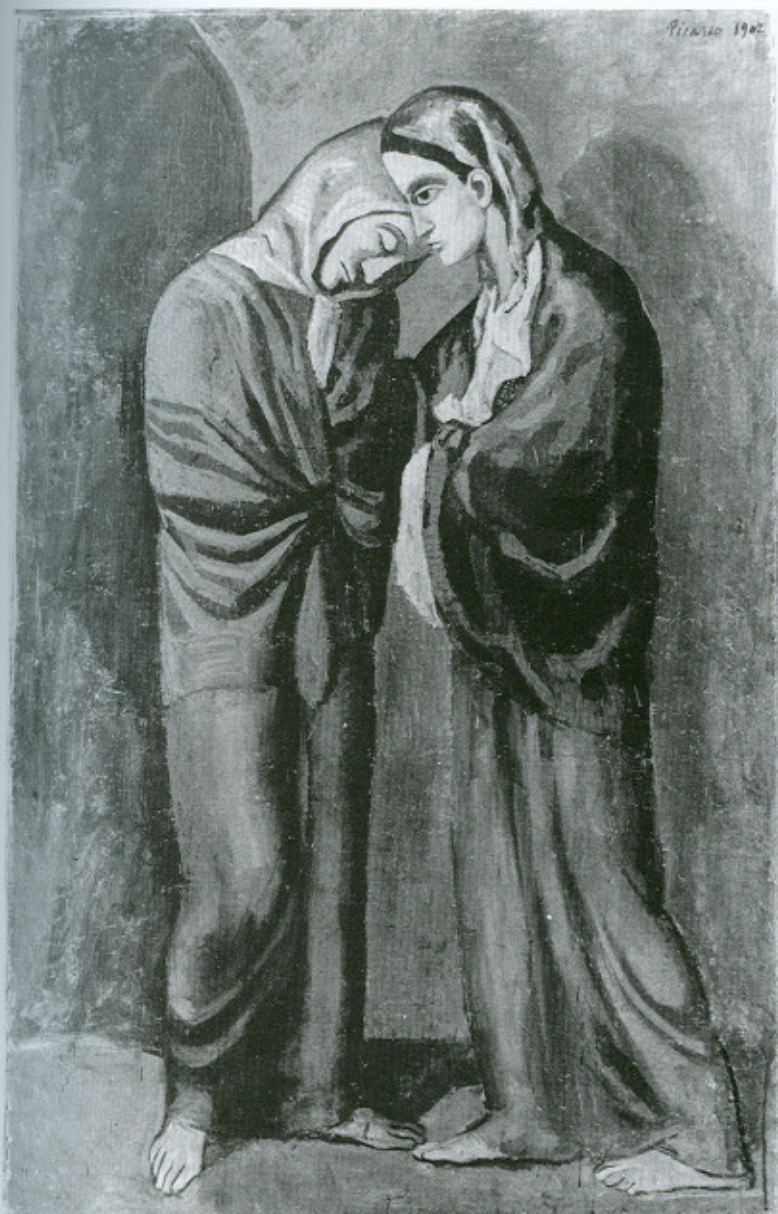
Plate 88 Pablo Picasso, Les Deux Soeurs ( Two Sisters ), 1902, oil on canvas, 152 x 100 cm. The Hermitage, Leningrad. © DACS 1993.

With Les Femmes d'Alger Picasso adopted a similar 'Baudelairean' theme, this time ambitiously envisaging a monumental painting in the 'great tradition', something that would be on a par with the Salon set-pieces of Ingres or Bouguereau, but which would also provide some critical distance from the subjects and techniques of Fauvism. This ambition was also related to psychological and social concerns, in particular to Picasso's morbid fascination with prostitution and venereal disease; his interest (shared with contemporaries) in the images and meanings of 'primitive' sculpture, and his experience of existence in a bohemian community textured by ethnic difference, anarchism, philosophical ideas and notions of sexual liberty.