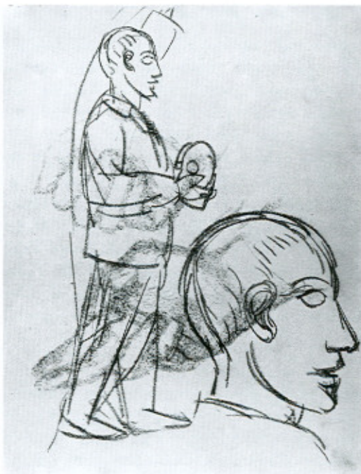
Plate 91 Pablo Picasso, study for Les Demoiselles d'Avignon , also known as Student with a Skull in his Hand (sketch-book page), winter-spring 1907, pencil on paper, 24 x 19 cm. Musée Picasso, Paris.