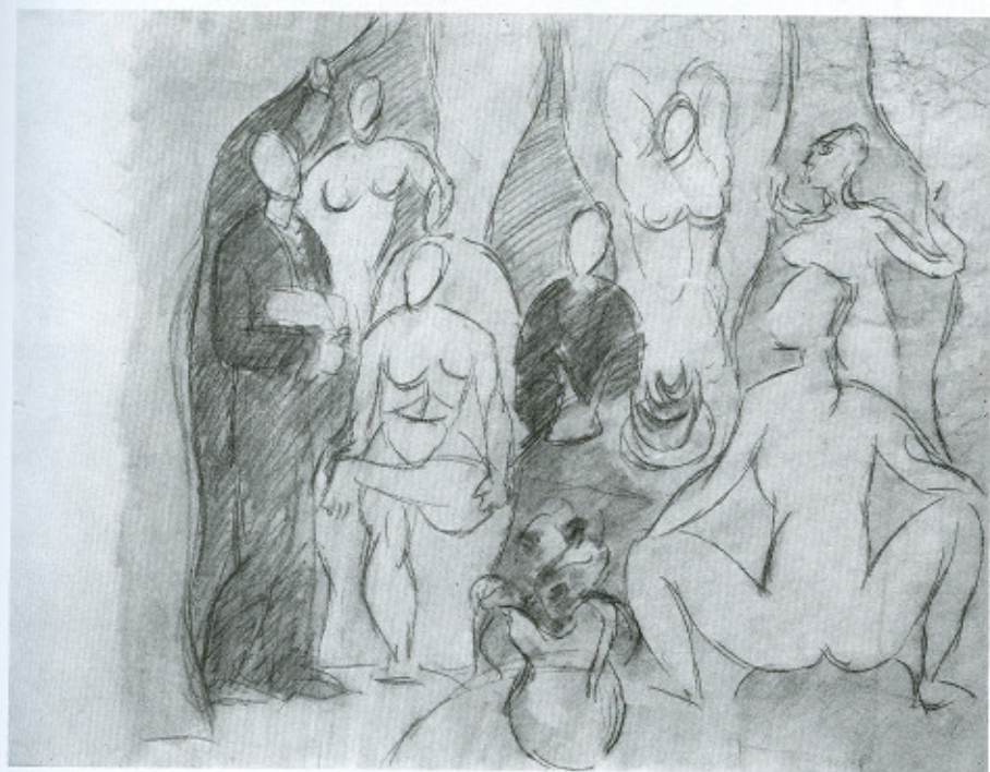
Plate 90 Pablo Picasso, study for Les Femmes d'Alger , spring 1907, pencil and pastel on paper, 48 x 63 cm. Oeffentliche Kunstsammlung Basel Kupferstick Kabinett. © DACS 1993.

The first plans for the painting may have originated in Picasso's drawings and paintings of two sailors on shore leave going into a brothel (Plate 93). However these and all male figures (Plates 91, 92, 94) were omitted from the final composition, which focuses on five women and the bowl of fruit, traditionally symbolic of abundance, of summer (one of the four seasons), of taste (one of the five senses) etc. In this arrangement, the envisaged viewer is male with the final painting consistent with the available representations of actual brothels and erotic photographs (Plates 95 and 96).