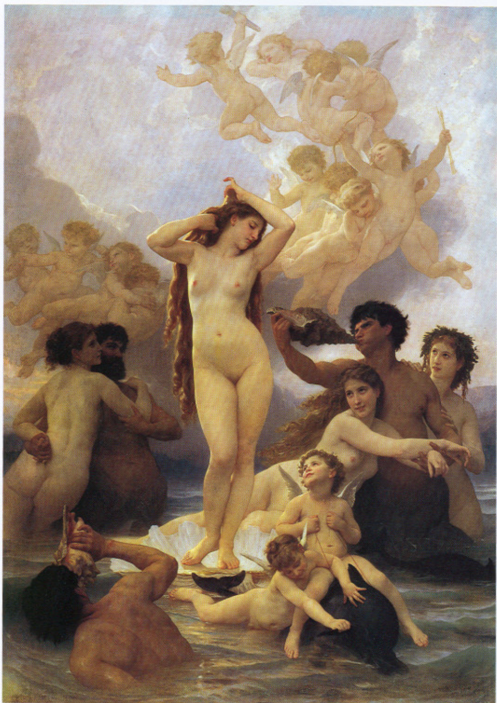
Plate 98 William-Adolphe Bouguereau, La Naissance de Vénus ( The Birth of Venus ), 1863, oil on canvas, 300 x 217 cm. Musée d'Orsay, Paris.