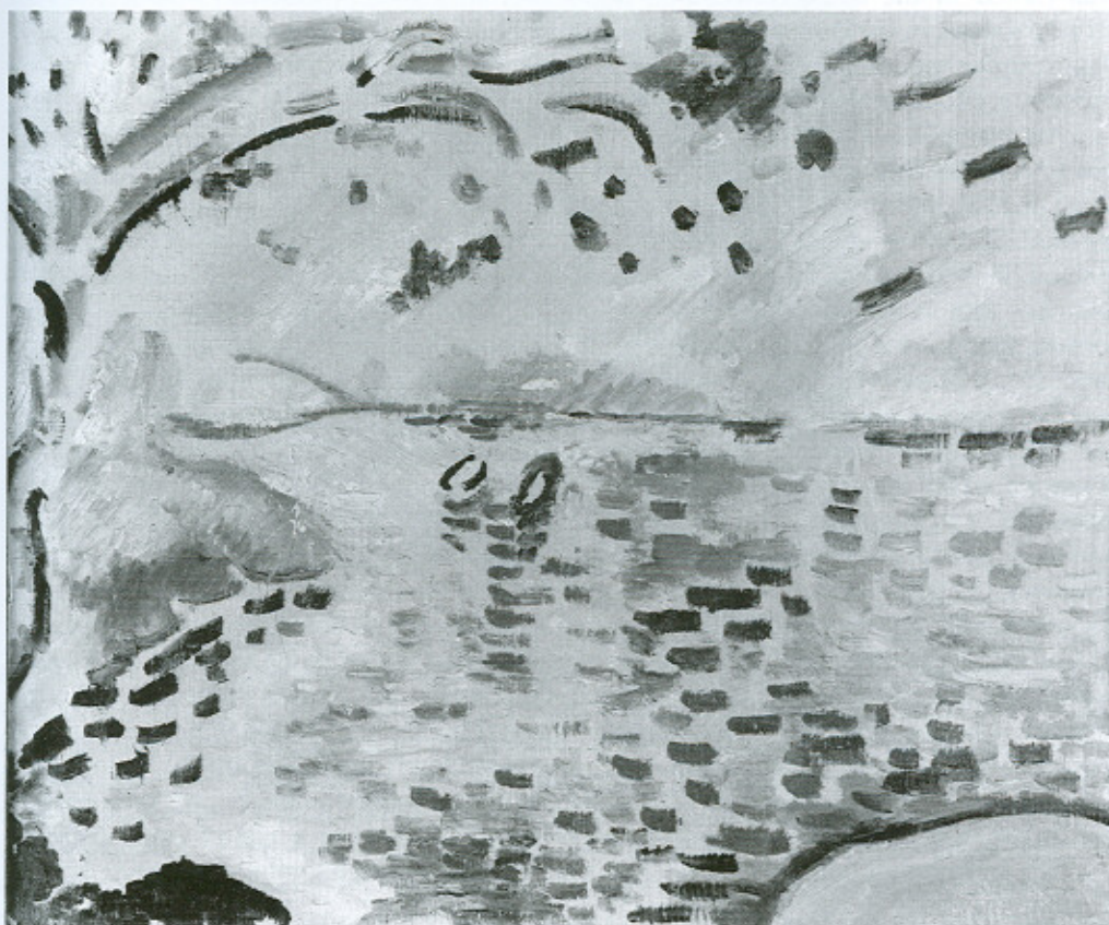
Plate 87 Georges Braque, Petite Baie de la Ciotat ( The Little Bay at La Ciotat ), 1907, oil on canvas, 36 x 48 cm. Centre National d'Art et de Culture Georges Pompidou, Musée National d'Art Moderne, Paris.

Another reason is that, from what we know of the planning and production of the painting, it was designed to be a 'major' intervention in contemporary practice. As such, it is revealing about the painting as a sign within rules constraining production. Although not exhibited until 1916, it had a considerable impact within a particular group c.1907, when small-scale, brightly coloured Fauvist depictions of themes such as coastal towns and the imagined and actual sites of pleasure were in vogue among self-styled 'progressives' (Plate 87 and Plates 41, 43). The production and display of these works were also wrapped up in the politics of 'independent' Salons and the developing