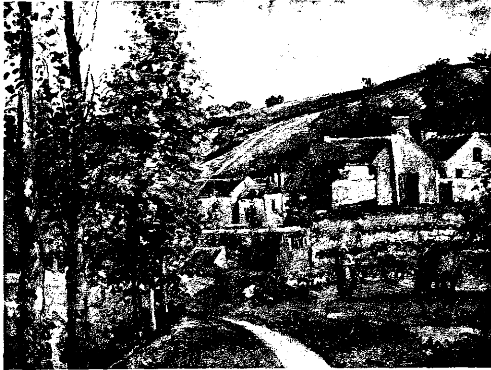
362 CAMILLE PISSARRO Village Near Pontoise 1873. 24 \times 31\frac{1}{4} (61 × 81)