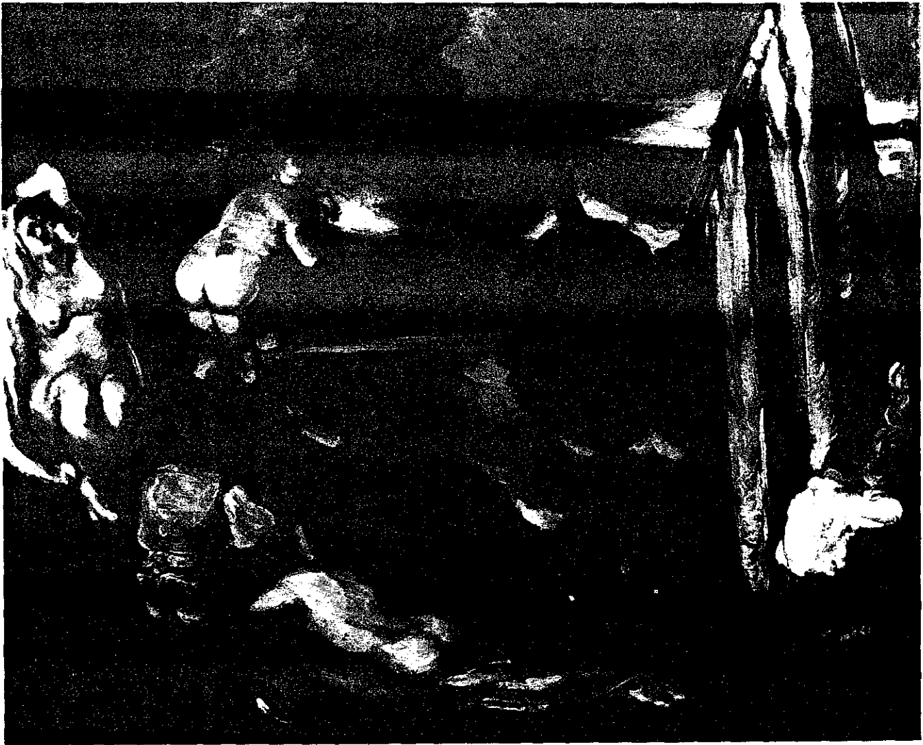
354 PAUL CÉZANNE Pastoral Scene ca. 1870. 25½ × 31¼ (65 × 81)

(Waters of Sextius) that gave the town its name. Cézanne thus began and concluded his career desiring to be the natural product of his beloved land; he would surely have wished it said of him, as the poet Max Buchon did of Courbet, that he “produced his paintings as simply as an apple-tree produced apples.”