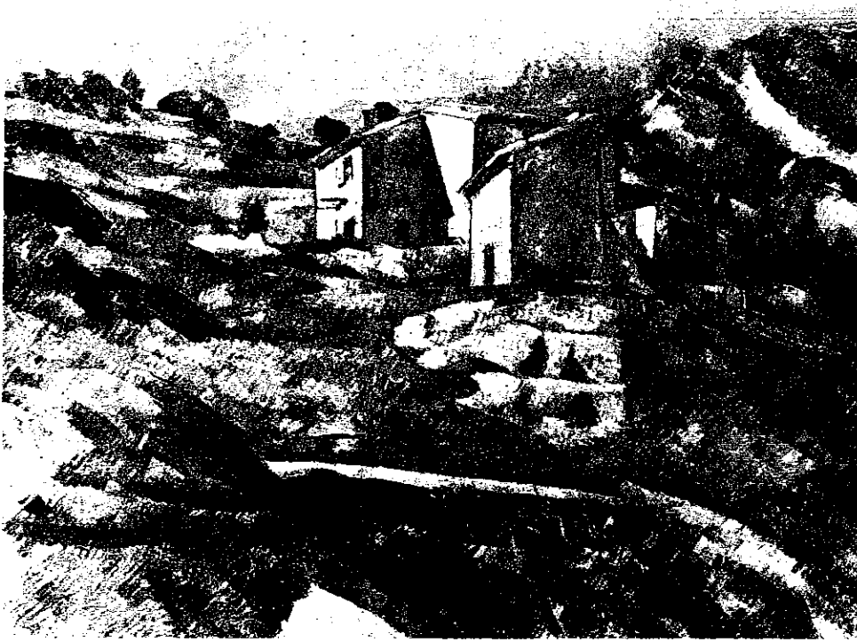
366 PAUL CÉZANNE Houses in Provence (Vicinity of L'Estaque) ca. 1879–82. 25½ × 32 (64.7 × 81.2)