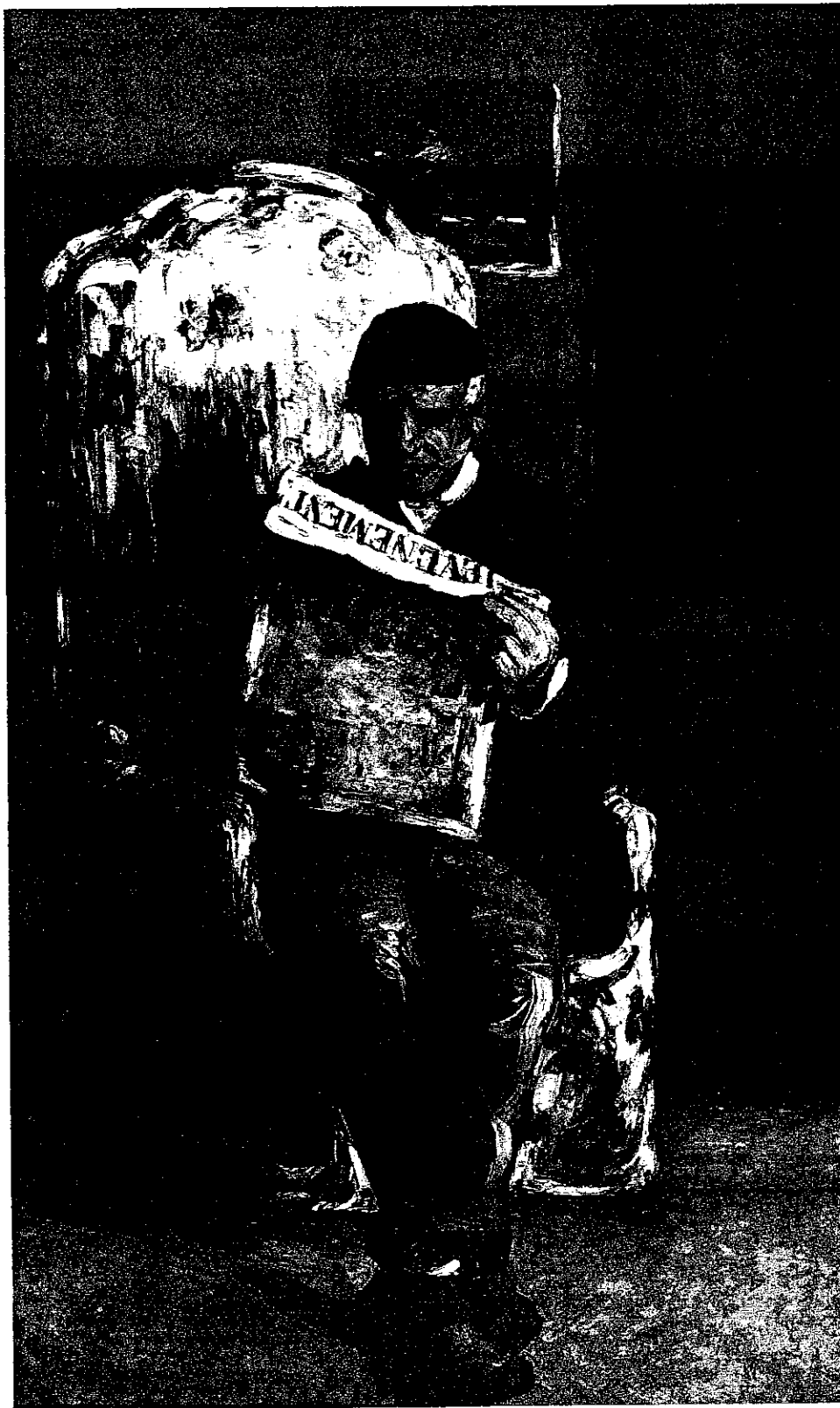
359 PAUL CÉZANNE Portrait of Louis-Auguste Cézanne, Father of the Artist, Reading L'Événement 1866. 78½ × 47½ (200 × 120)