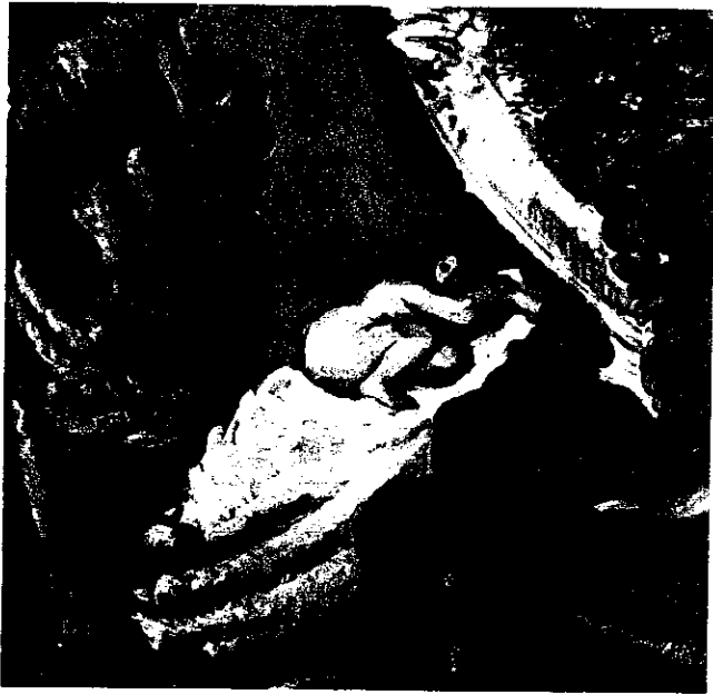
355 PAUL CÉZANNE A Modern Olympia ca. 1869-70. 22 × 21½ (56 × 55)