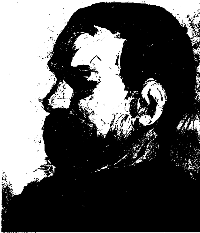
357 PAUL CÉZANNE Portrait of Uncle Dominique 1866. 15½ × 12 (39.5 × 30.5)

father's career wishes for him (Louis-Auguste would have preferred his son to be a banker or lawyer, like himself), Cézanne became a romantic and an intransigent. Despising the person and rule of Napoleon III, and approving the character and politics of Jacques Vingtras (from Jules Vallé's anarchist novel of the same name), the young artist was a rebel but not yet a revolutionary. Jean-Paul Sartre described the difference: "The revolutionary wants to change the world; he transcends it and moves toward the future, toward an order of values which he himself invents. The rebel is careful to preserve the abuses from which he suffers so that he can go on rebelling against them. He always shows signs of a bad conscience and of something resembling a feeling of guilt. He does not want to destroy or transcend the existing order; he simply wants to rise up against it."