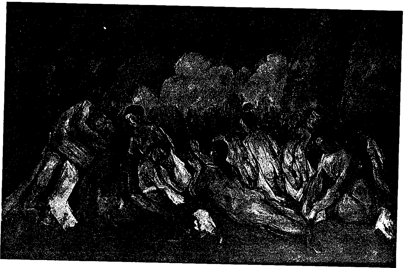
361 PAUL CÉZANNE The Large Bathers 1900-06. 67¾ x 77½ (172.2 x 196.1)