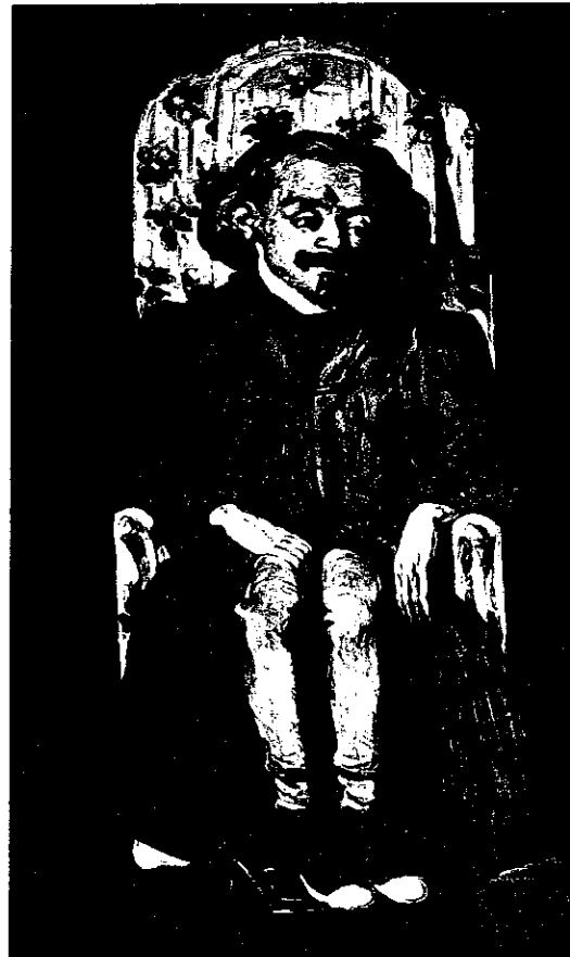
358 PAUL CÉZANNE Portrait of the Painter, Achille Emperaire ca. 1868–70. 78½ × 48 (200 × 122)

In The Rape (probably representing Pluto's abduction of Persephone), Cézanne focuses equally upon the nude foreground figures, the female attendants in the left middle-ground, and the truncated Mont Sainte-Victoire in the background. Painted with looping and undulating strokes of paint, the riverbank, water, foliage, mountain, and sky are given nearly equal visual weight, suggesting an all-over two-dimensional structure and balance that act as a counterforce to the emotional depth and expressiveness of the narrative. In other words, even though the picture represents a misogynist dream, its style suggests detachment, abstractness, and objectivity. Even as the young Cézanne indulged his obsessional fears and hatreds of modern woman, he struggled to overcome them in order to re-order vision and design into a single unified procedure.