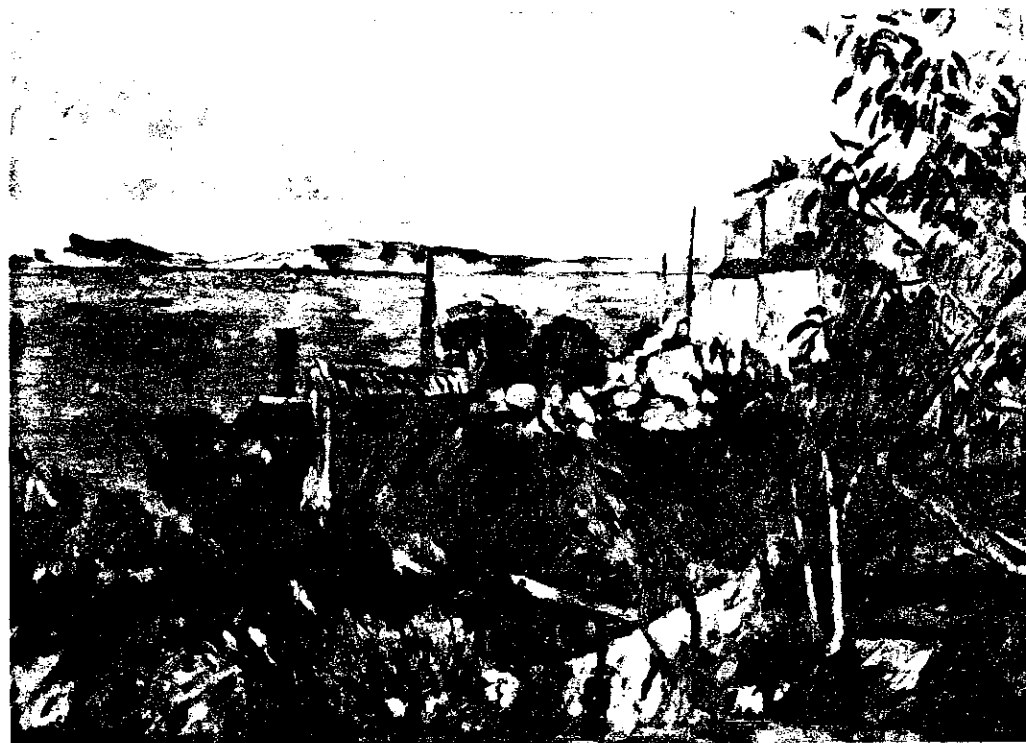
364 PAUL CÉZANNE L'Estaque ca. 1876. 16½ × 23½ (41.9 × 59)