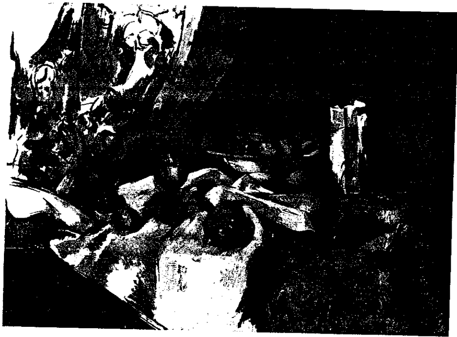
360 PAUL CÉZANNE Still Life With Apples ca. 1895-8. 27 x 36½ (68.6 x 92.7)