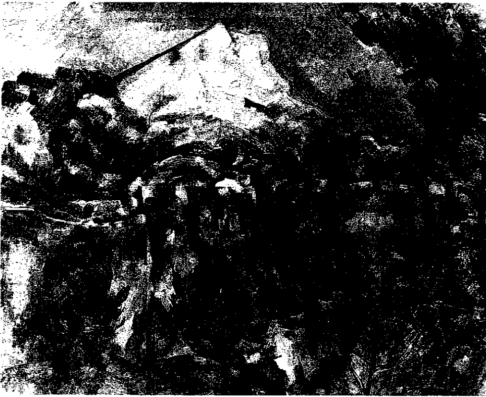
367 PAUL CÉZANNE Mont Sainte-Victoire Seen From Bibémus ca. 1898–1900. 25½ × 31½ (65 × 80)