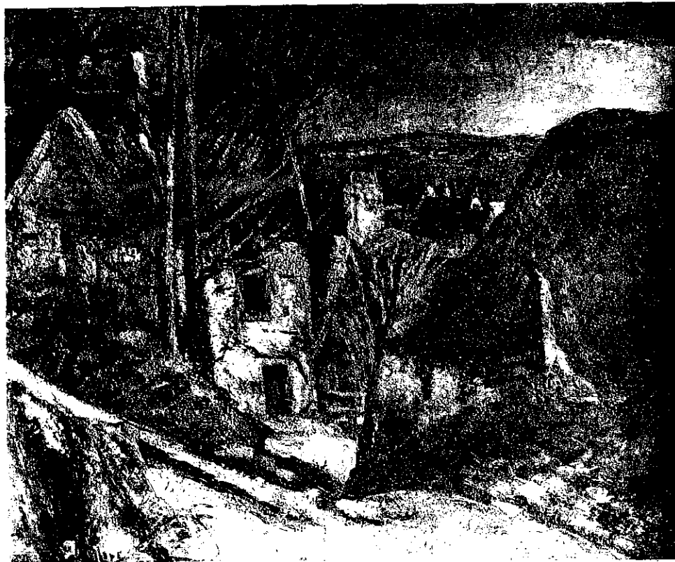
363 PAUL CÉZANNE House of the Hanged Man, Auvers-sur-Oise ca. 1873. 21\frac{1}{8} \times 26 (54.9 × 66)