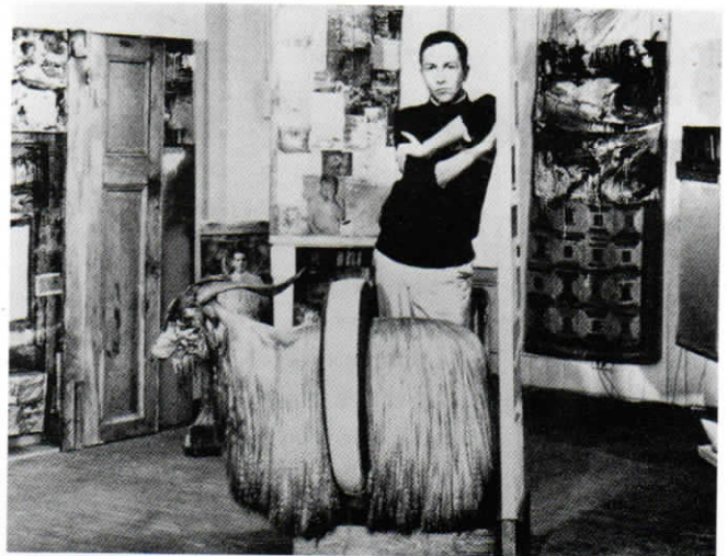
Rauschenberg in his Front Street studio, New York, 1958

For artists such as Robert Rauschenberg (b. 1925), Jasper Johns (b. 1930), Larry Rivers (1923–2002), John Chamberlain (b. 1927), Richard Stankiewicz (1922–83), Lee Bontecou (b. 1931), Jim Dine (b. 1935) and Claes Oldenburg (b. 1929), art was to be expansive and inclusive, appropriating non-art