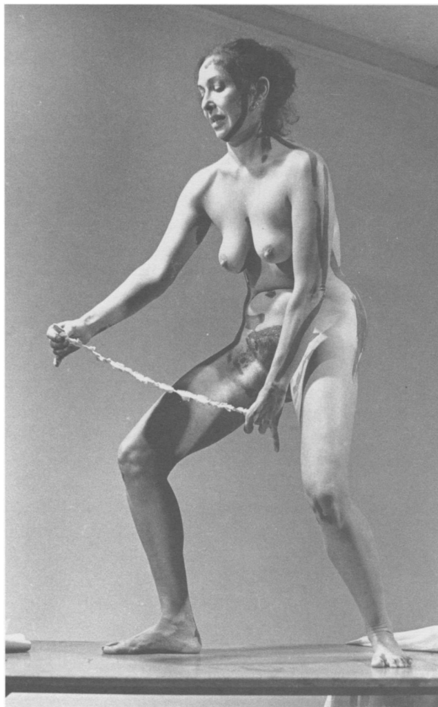
FIG. 2 Carolee Schneemann, Interior Scroll , 1975.

I have already made clear that I specifically reject such conceptions of body art or performance as delivering in an unmediated fashion the body (and implicitly the self) of the artist to the viewer. The art historian Kathy O'Dell has trenchantly argued that, precisely by using their bodies as primary material, body or performance artists highlight the "representational status" of such work rather than confirming its ontological priority. The representational aspects of this work—its "play within the arena of the symbolic" and, I would add, its dependence on documentation to attain symbolic status within the realm of culture—expose the impossibility of attaining full knowledge of the self