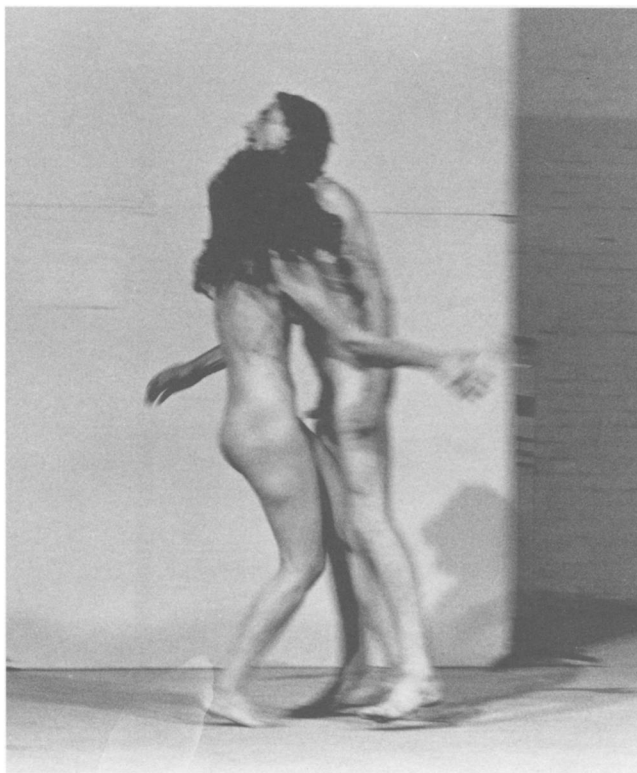
FIG. 1 Marina Abramovic/Ulay, Relation in Space . Performed at Venice Biennale, 1976.

I have been accused on the one hand (by art historians) of not caring enough about “the archive” and artistic