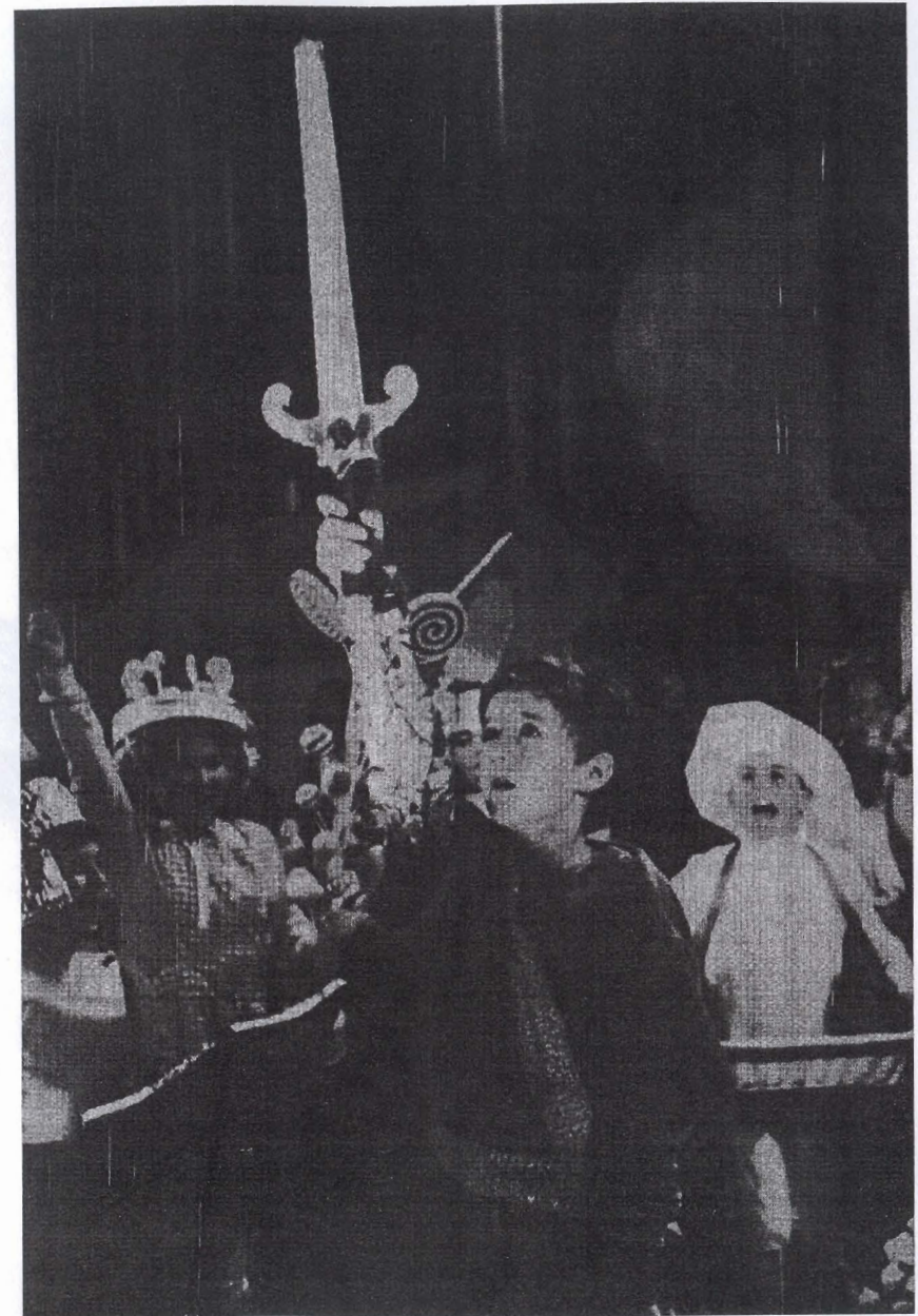
Cole (Haley Joel Osment) as the boy Arthur in his school play in M. Night Shyamalan's 1999 film The Sixth Sense.

This account of Sir Millard's adventures was discovered in an old Welsh castle by myself when exploring the ancient ruins. It is the story of a young squire leaving his duties to find and prove his knighthood by some miraculous accomplishment.