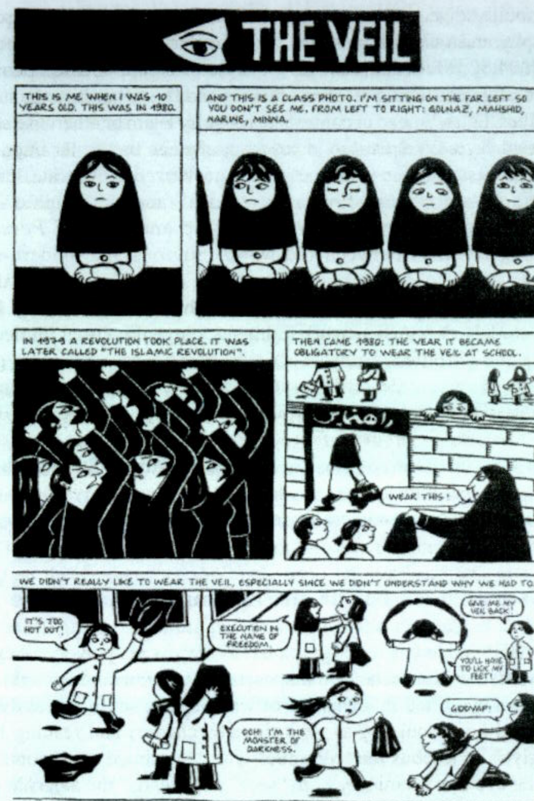
Fig. 1. Persepolis: The Story of a Childhood (2003:3).

Named for a ruined, ancient Persian capital city (circa the first millennium BCE) and framed in time by modern-day events pertinent to Iranian history, the Persepolis books chronicle aristocrat-descended Satrapi’s life between the ages of six and twenty-five, relaying her child-eyed experience of Iran’s revolution of 1979, her high-school years spent sans family in Austria, and formative period as a university graphic-arts student and young wife in Tehran following return to her homeland in the late 1980s. Geopolitical space, documentary perspective, and ontological outlook are simultaneously branded in Persepolis through a braided lexicon of symbols and signs, drawn and written completely in stark, black-and-white and announced on the opening