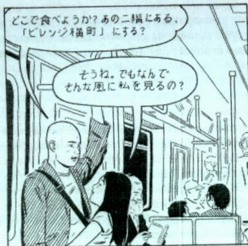
Fig. 6. Shortcomings (2007:90).

Verbal code switching in comics that similarly blurs and slips along imagistic-linguistic divides invites decoders to translate meanings that elude or bypass the symbolic order, a stylistic gesture that mirrors changing pattern-language demographics in the virtual world. (Recall for instance Gibson's allusions in Pattern Recognition to Kanji or Cyrillic as viewed by an English-only reader.) As the pattern of comics uniquely inscribes, the future of seeing-as-reading has arrived.