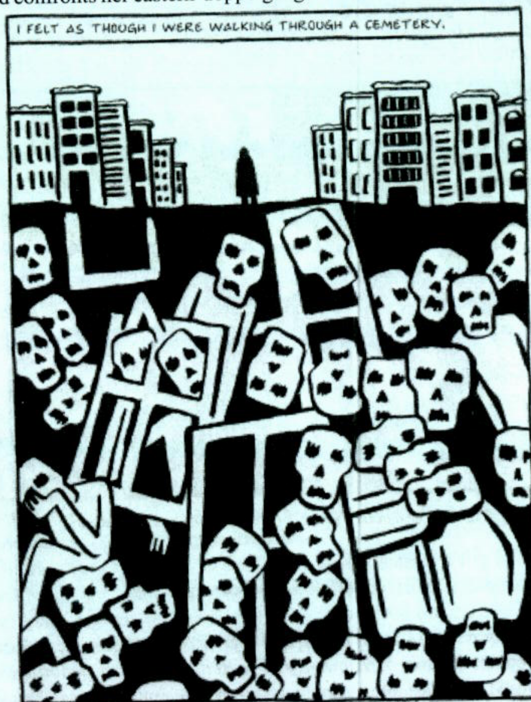
Fig. 3. Persepolis: The Story of a Return (2004:97).

suffered through the narrator's dislocation as well as how they are psychologically experienced. Likewise reinforcing the theme of exile, gothic correspondences are visible in a photo-like portrait of Marjane surrounded by freakish, adolescent friends, including the macabre Momo, who is obsessed with death (Satrapi, 2004:13). Cartoon Marjane's geographical estrangement is further dramatized near the centerfold of book two with reintroduction of Islamic patterning, reproduced in a three-quarter-page panel that accents a close-up of her face as, preparing to leave Vienna, she "again puts on [her] veil" and confronts her eastern-doppelgänger reflection in a mirror (2003:91).