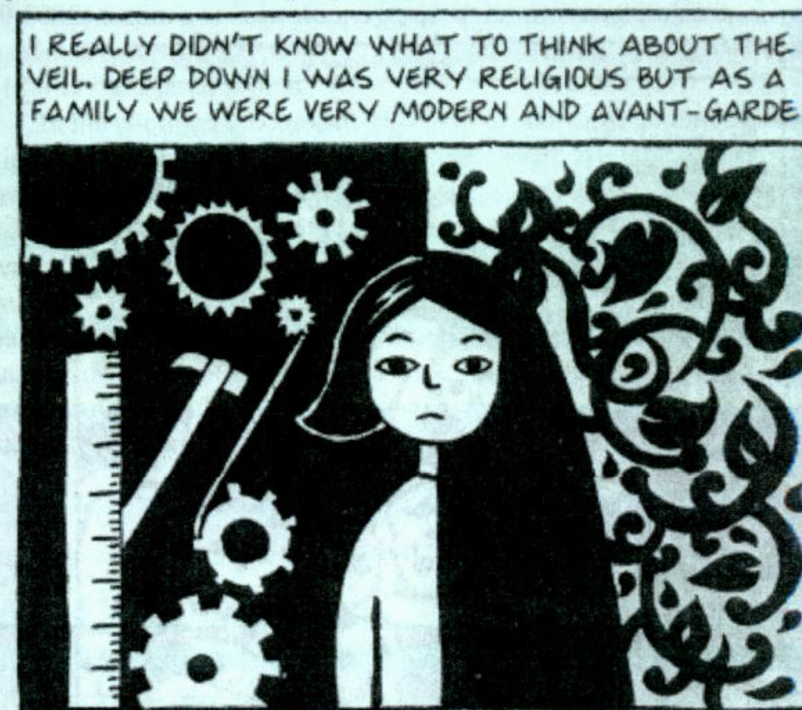
Fig. 2. Persepolis: The Story of a Childhood (2003:6).

word dyad exemplifies what Ricío Davis calls real-life Satrapi's deepening identity as "a transcultural writer," one who in residing outside both her language and culture of origin creates "intermittent time and interstitial space" in literature, projecting comprehension of "migrant and ethnic identity...neither as purely assimilationist nor oppositional" (2005:264, 256, quoting Homi Bhabha, 266). Portrayed as inchoate and troubling in this panel, Marjane's bifurcated subject position will crescendo in the second installment of Satrapi's graphic memoir as arabesque patterns meet visions of the grotesque.