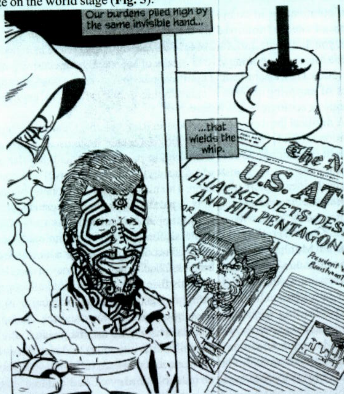
Fig. 5. Can't Get No (2006:n.p.).

In a telling pictorial sequence, Chad, now a solitary, challenging figure again similar to a pachuco separated in time and space from the society from which he originates (Paz, 1961 [1950]:17), momentarily finds safe harbor along the roadside with a Lebanese-immigrant couple, who have fled the city in an RV. Functioning through dialogic integration and code sharing, Chad's graphic tag and the wife's headscarf personify the trauma of east meeting west in our contemporary, ongoing phase of geopolitics, where boundaries collapse and atomize on the world stage (Fig. 5).