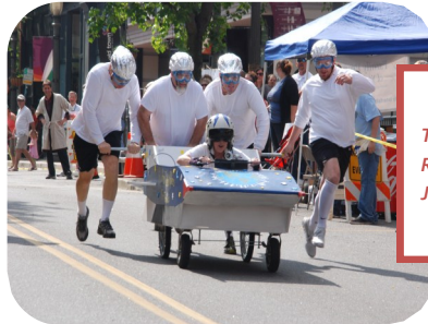
The Rocket Rollers of St. John's UMC.

The Fresh Start program began in 2010 as a result of the City of Rock Hill providing a duplex to Family Promise. This duplex is used to house homeless couples or families without minor children. They are provided all the same services as those in the IHN program.