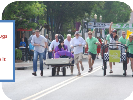
Hardin's Bed Bugs & Spring's Creative's Turn and Burn battle it out!