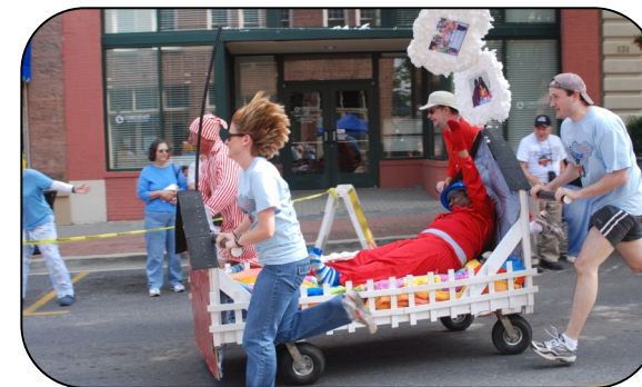
Family Promise’s Dream Team

Fastest Bed – Overall fastest times Judge’s Favorite – Most creative design / Best Theme People’s Choice—Most money raised