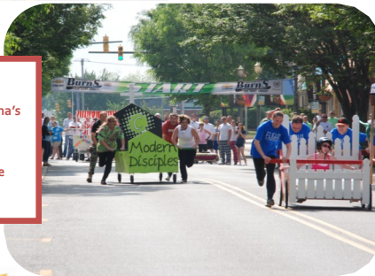
The Modern Disciples (Carolina's Cornerstone) & Sweet Dreams (Oakland Avenue Presbyterian).