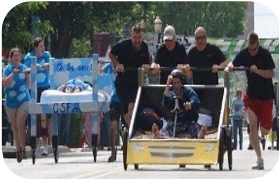
First year Champions, Burns Bedracer (Burns Chevrolet), as they take the lead from On the 7th day (Oakland Baptist) for the win!!